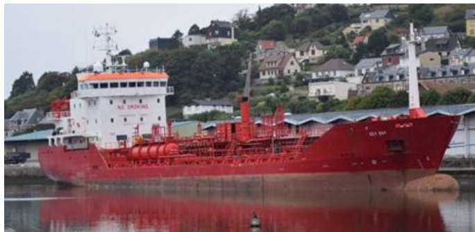
Tanker Key Bay arriving Fécamp

On 16 September 2016 the Gibraltar-registered chemical tanker 'Key Bay' yesterday arrived in the town of Fécamp, France, with a controversial cargo: tonnes of fish oil from Western Sahara. When asked about the import, French customs refused "to comment while the court case is still ongoing".